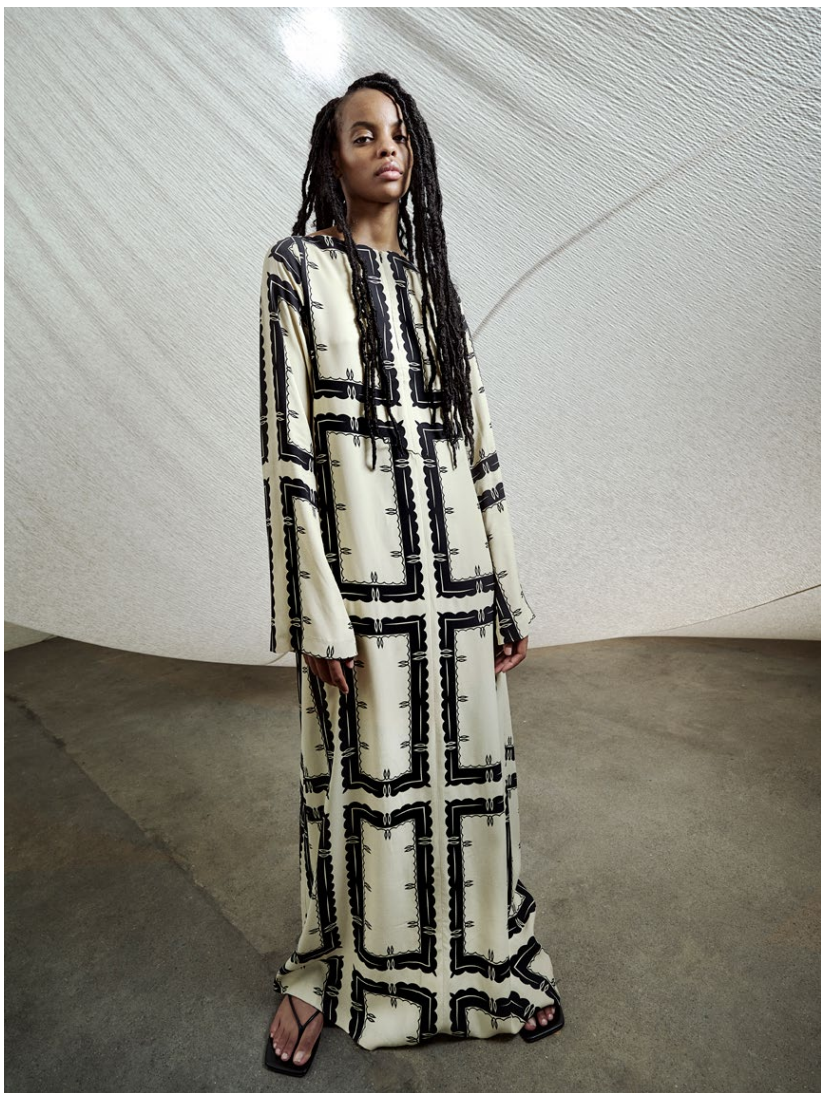
BAJUNA DRESS, TEVISA SANDALS