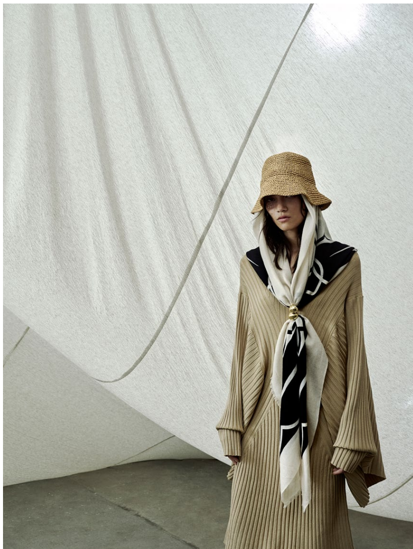
SAMIA DRESS, GARIA SCARF, STRAW HAT