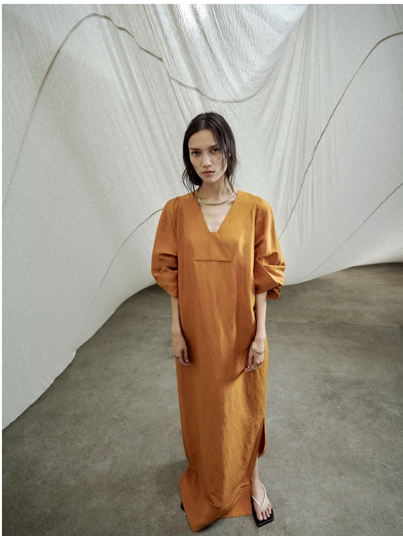
MAENNA DRESS, TEVISA SANDALS