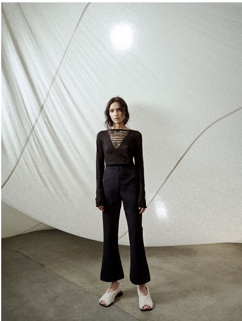
TESH TOP, VALIMA TROUSERS, TREZA HEELS