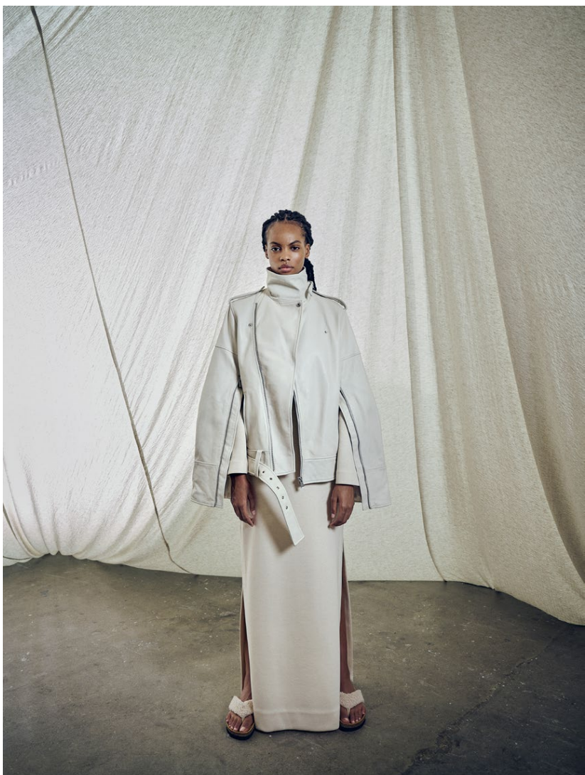
DOULETTE DRESS, BEATRISSE JACKET, KIRAS SANDALS