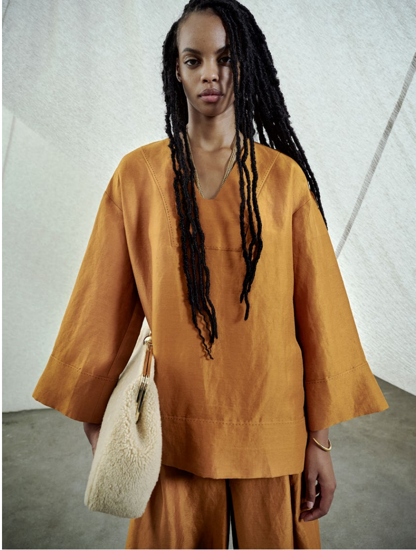
TESSALINE BLOUSE, POYLANNA TROUSERS, WANDAS BAG