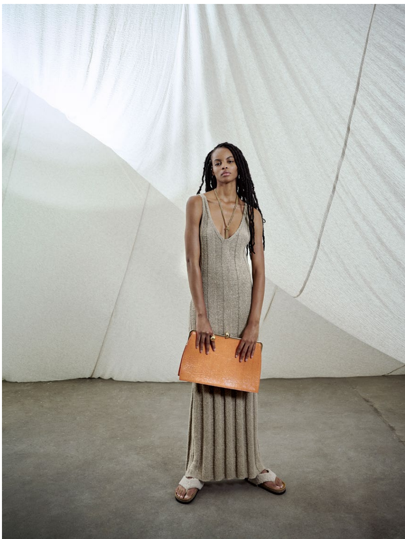
HARLEE DRESS, WANDAS BAG, KIRAS SANDALS