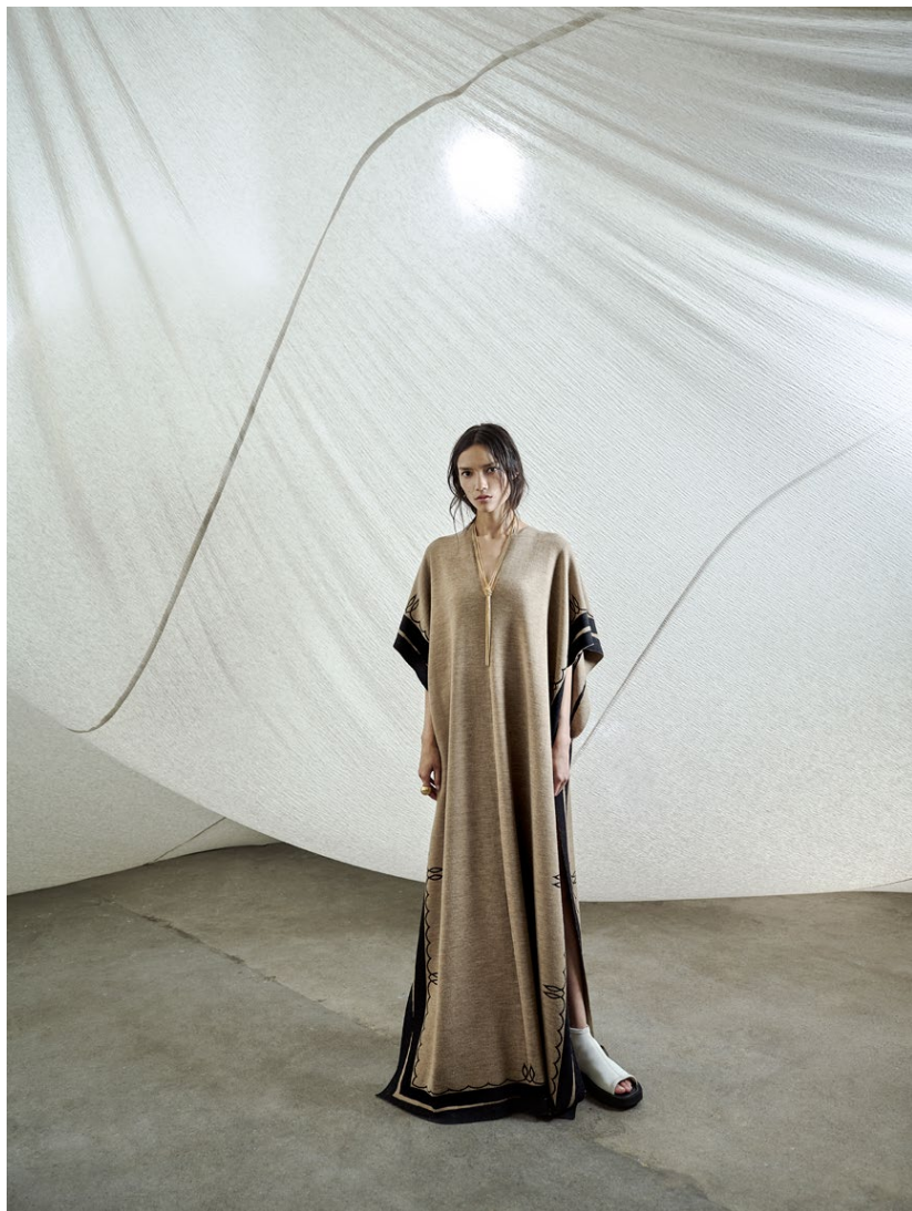
VINNY DRESS, PERNILAS SANDALS