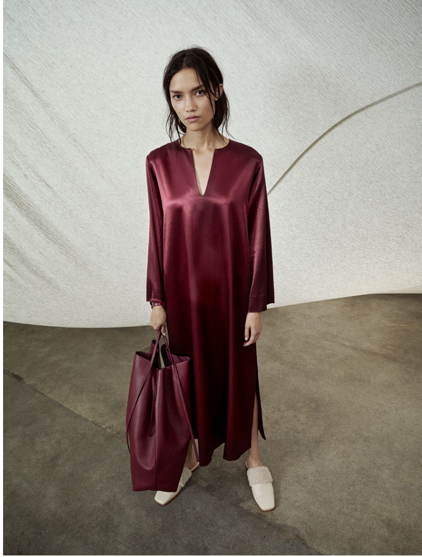
SANDINE DRESS, ABILLOS BAG, MOLLYS SLIPPERS