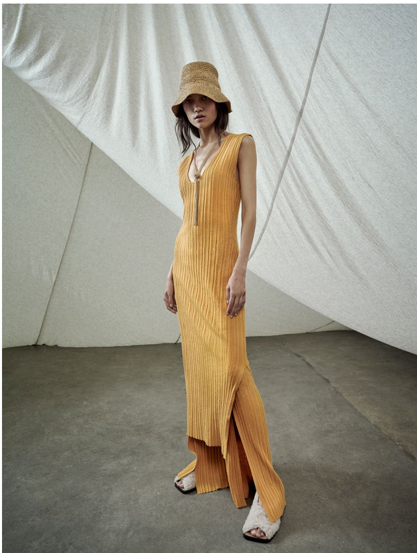
ISOLE DRESS, IRVAN TROUSERS, STRAW HAT, TREZA HEELS