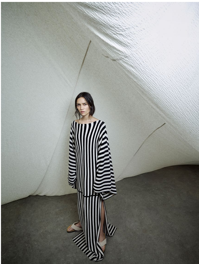
GERIA DRESS, KIRAS SANDALS