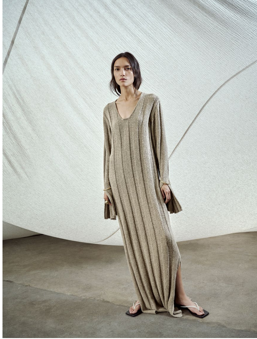
HAYDEN DRESS, TEVISA SANDALS