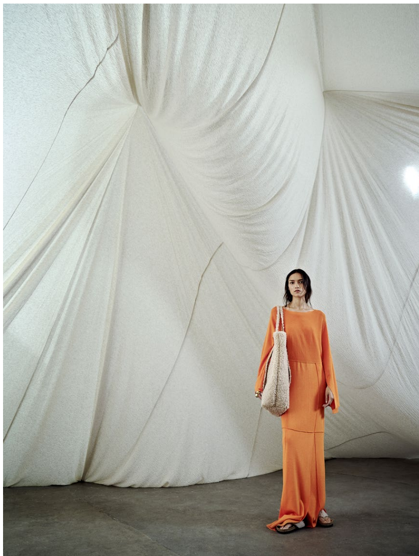
HARLIM DRESS, ABILLOS BAG