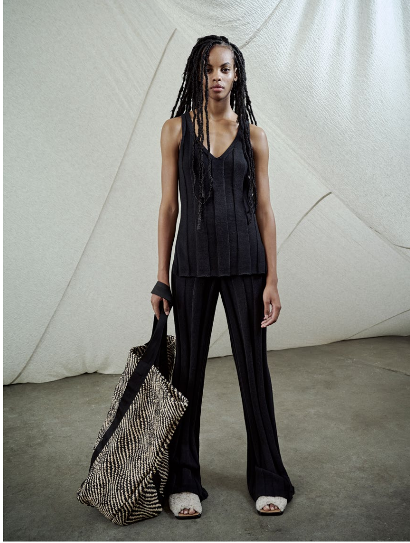
HALLIE TANK, HARIS TROUSERS, SHAZLIN BAG, TREZA HEELS