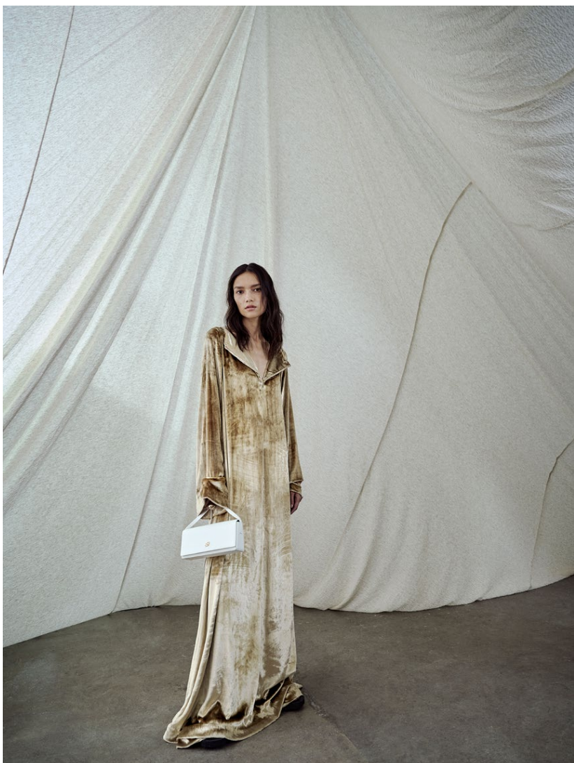
BAJUNA DRESS, CHIARA BAG