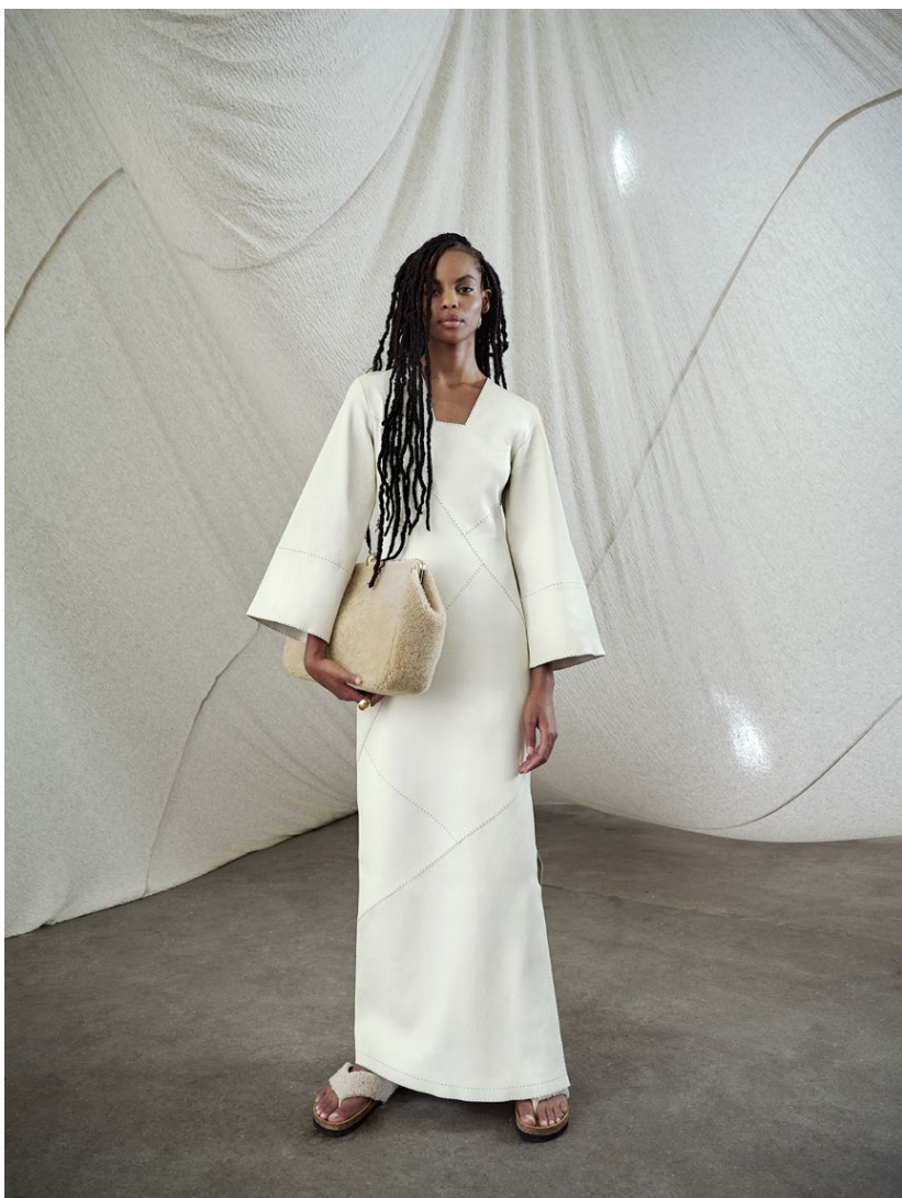
DAISYAN DRESS, WANDAS BAG, KIRAS SANDALS