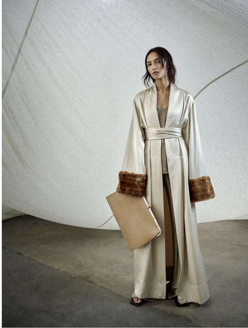
HALLE TANK, HARIS TROUSERS, TOSHINES JACKET, WANDAS BAG