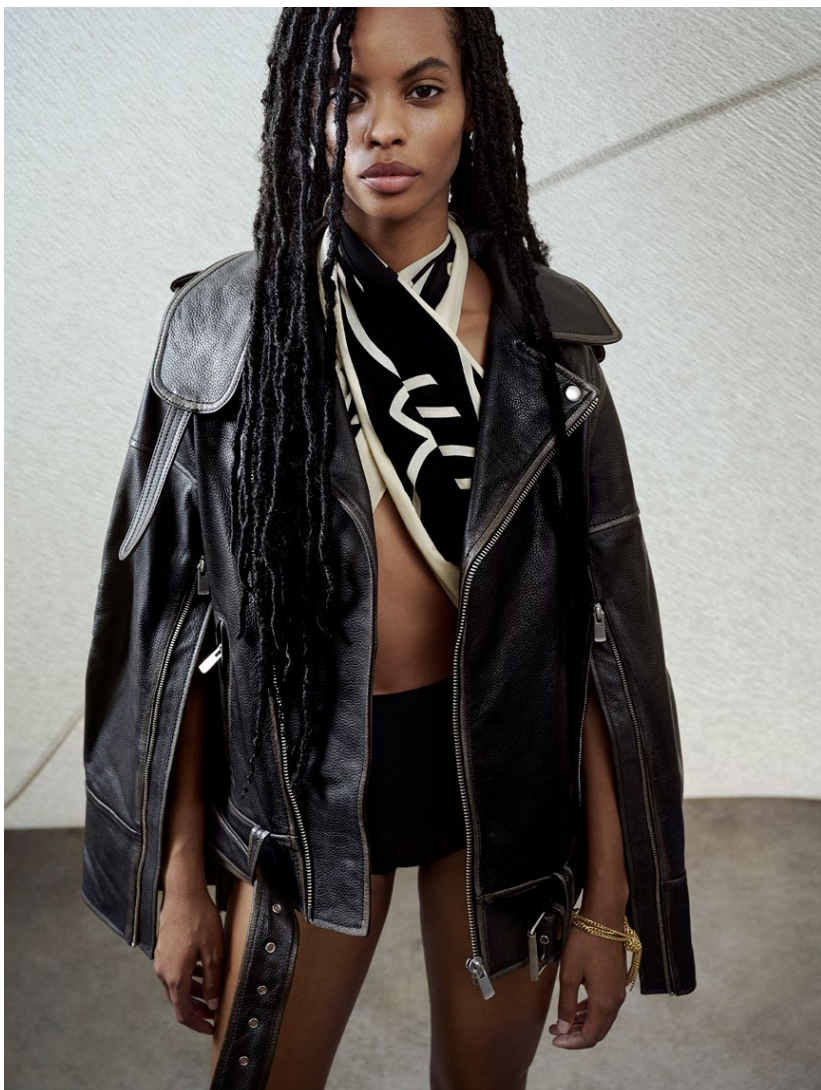
BEATRISSE JACKET, BELIRA BIKINI BOTTOM, GARIA SCARF