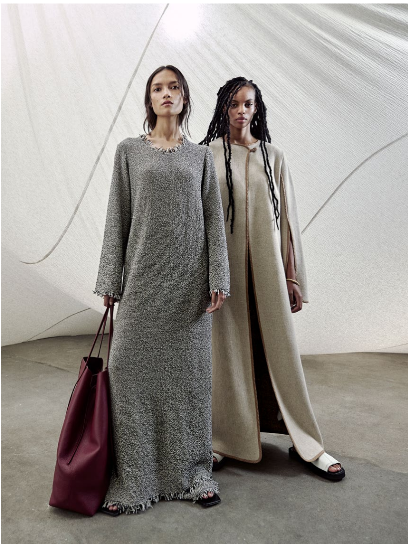
AGGIALE DRESS, ABILLOS BAG, TEVISA SANDALS & SOPHIEA COAT, PERNILLAS SANDALS