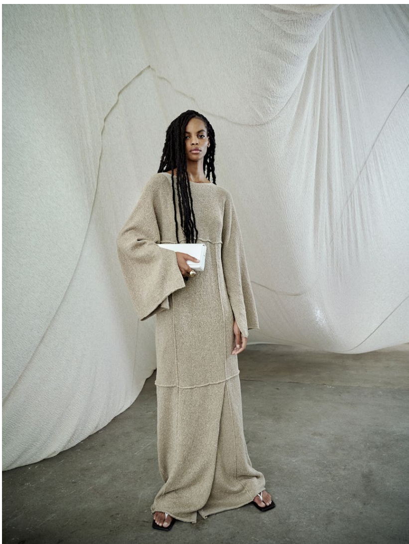
HARLIM DRESS, CHIARA BAG, TEVISA SANDALS