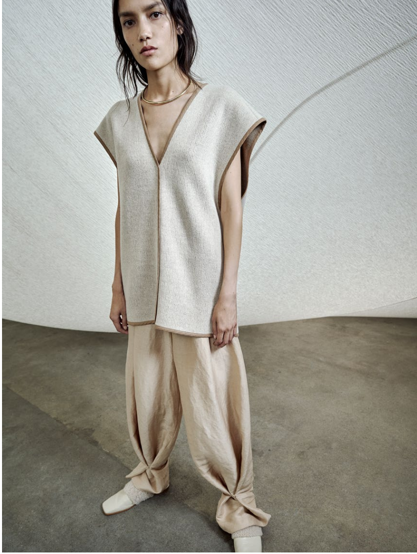
STEPHANIEA VEST, POVILANNA TROUSERS, MOLLYS SLIPPERS