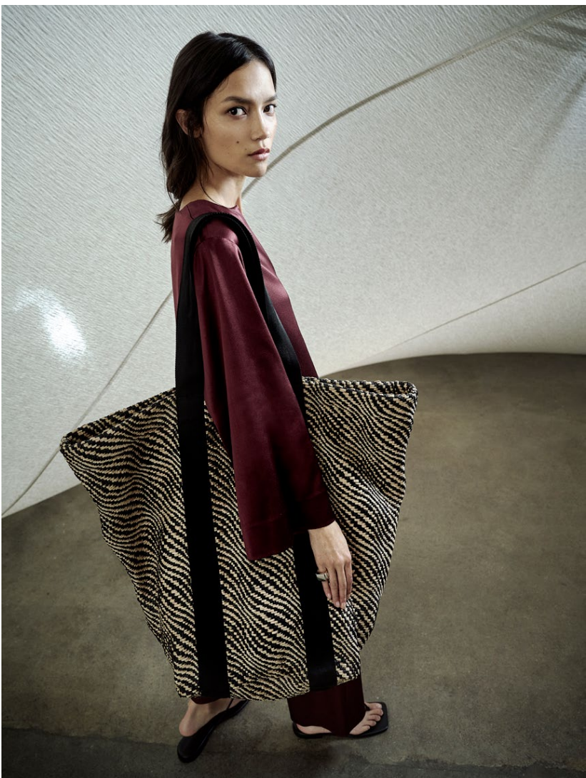
SANDINES BLOUSE, EVILIA TROUSERS, SHAZLIN BAG