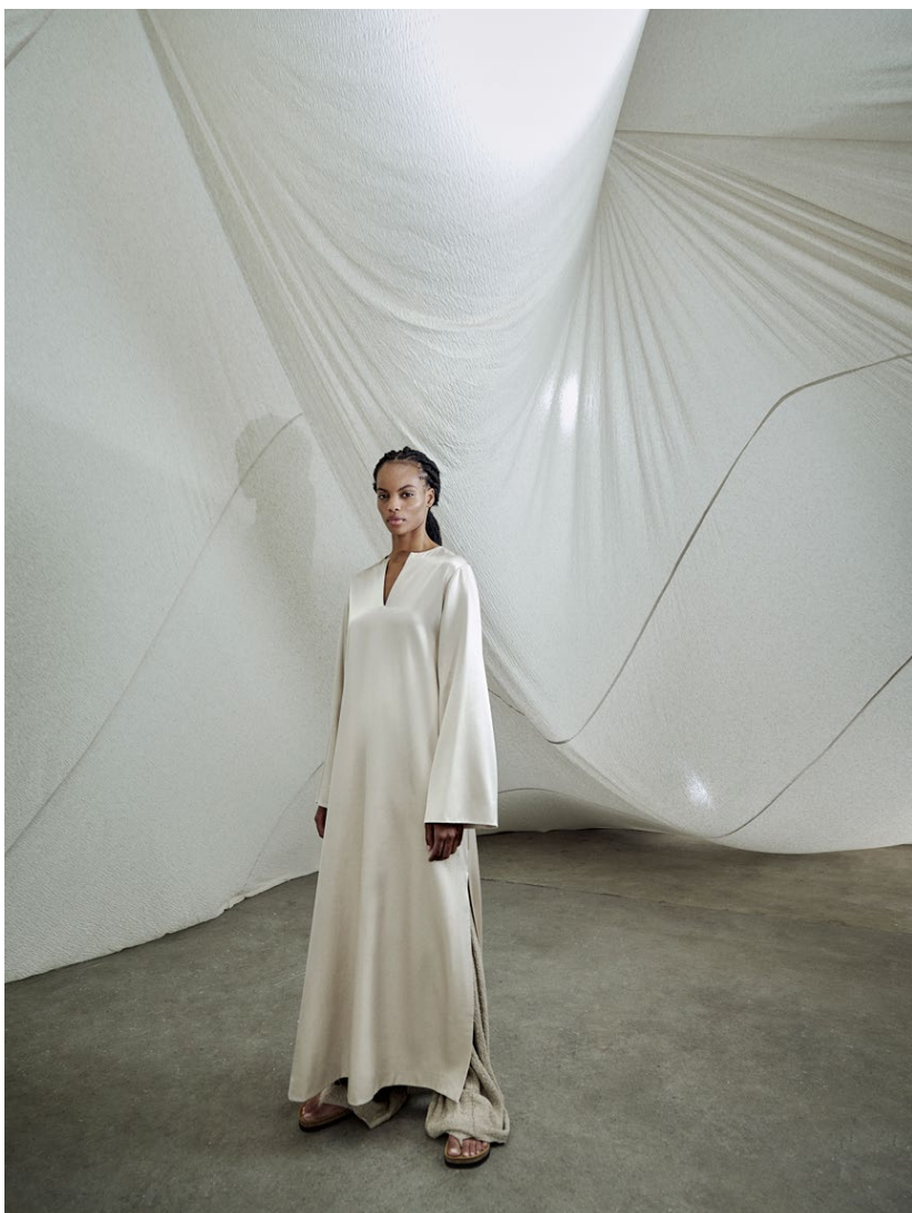
SANDINE DRESS, HARI TROUSERS