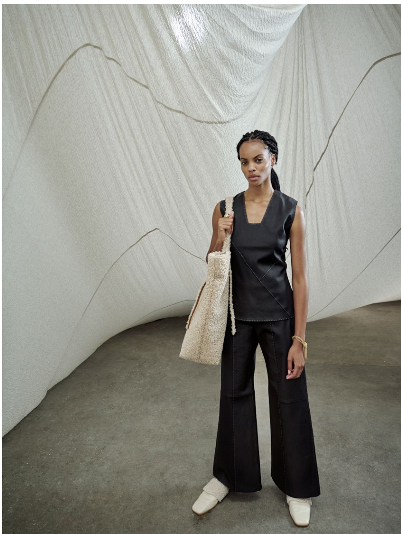
DAISYANNA TOP, MILORA TROUSERS, ABILLOS BAG, MOLLYS SLIPPERS