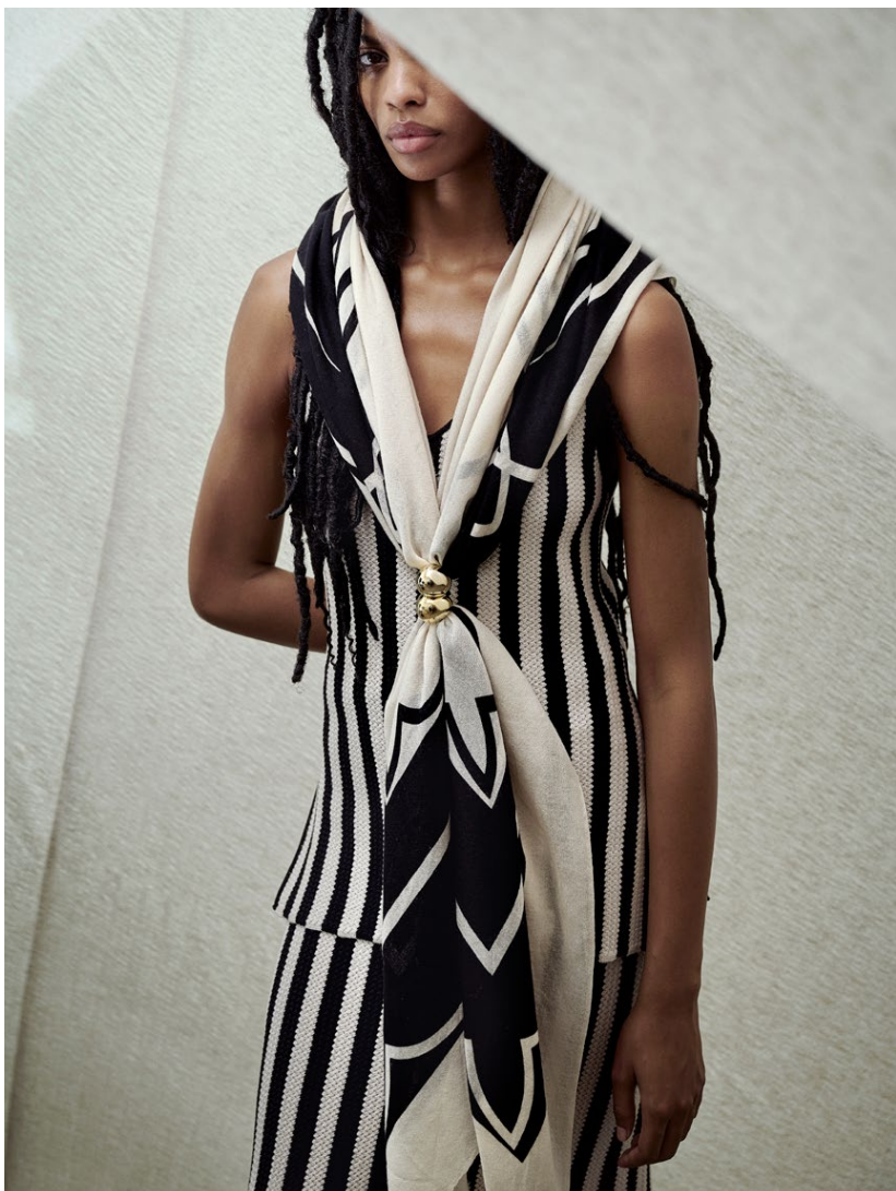
HALLIE TANK, GEBIA SKIRT, GARIA SCARF