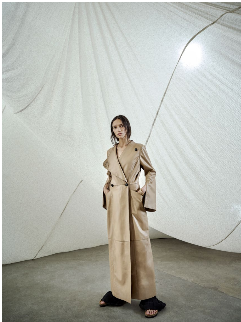
BORIANE LEATHER COAT